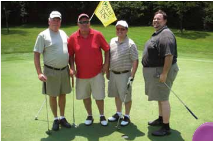
2nd place team: LG&E