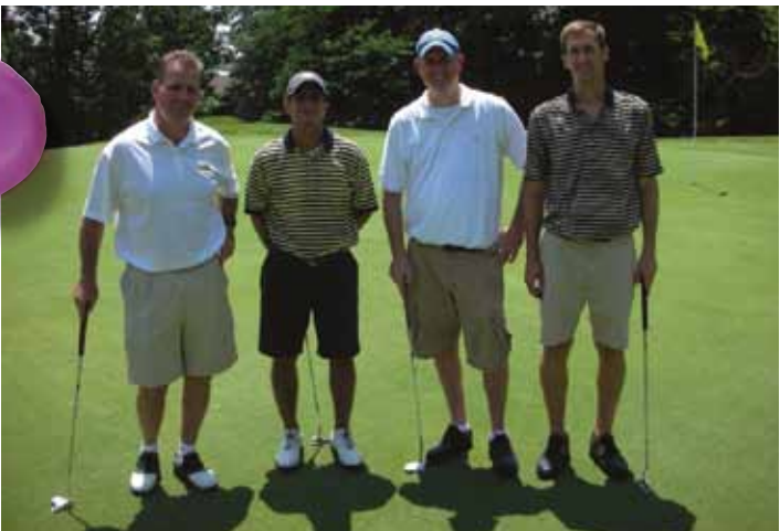
3rd place team: PNC Bank

In June, Family & Children's Place held its 9th annual golf scramble at the beautiful Quail Chase Golf Course. Over 200 participants hit the links to support agency programs while enjoying food and prizes throughout the day. By day's end, $25,000 was raised.