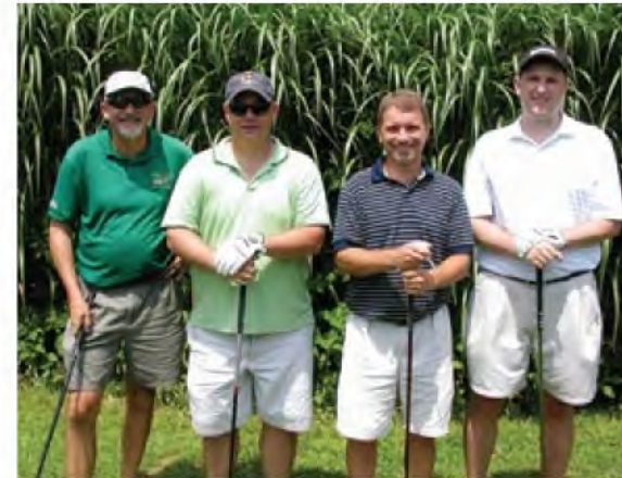
Irish Hill Foods

The Family & Children's Place Golf Scramble had a great turnout this year. More than 150 golfers (42 four-player teams) participated at Long Run Golf Course to support families and children affected by violence, abuse and neglect. Volunteers and golfers helped us raise nearly $40,000. The morning winner was Irish Hill Foods, while Brown-Forman took the prize in the afternoon.